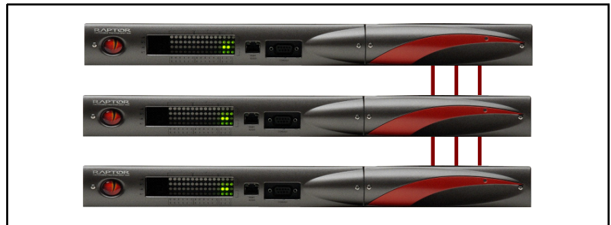
FIGURE 1. Plug-and-Play 20-Gbps Ring Topology

This network of ER-1010s are connected in a plug-and-play 20-Gbps ring topology.